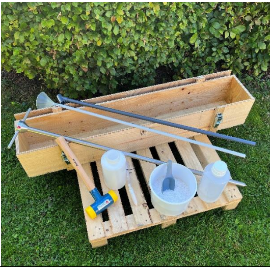
The installation kit

PRENART soil water sampler PRENART collecting bottle with screw cap PRENART steel rod, diameter 24 mm Plastic or metal pipe, max diameter 20 mm Plastic pipe with funnel Water 1-2 L beaker Silica flour Vacuum pump